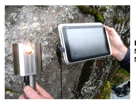
Fig. 3: Measurement details at bedrocks: Measurement head and tablet computer

Fig. 2: Field measurements with prototype of REO-Explorer